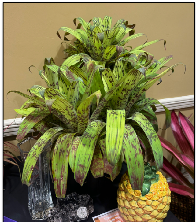
Goudea ospinae gruberi 'Streaker'

Please join us for this informative presentation and enjoy all of our other bromeliad activities such as show and tell, plant raffle, silent auction of unusual plants, and great refreshments.