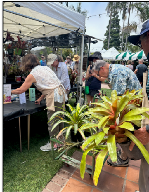
Loading up a large purchase for transport to the car.