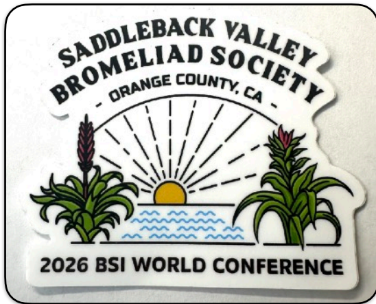
Amy's WBC sticker.